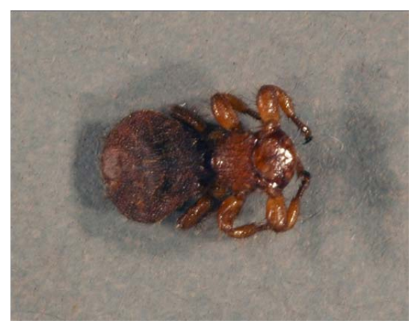
Figure 1: Sheep Ked

The sheep ked, Malophagus ovinus, is often referred to as the sheep tick. It is an external parasite of sheep that will spend its entire life cycle on the sheep. While it resembles a tick, it is actually a wingless fly. It can be found all over the world and at any time of the year.